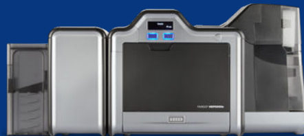
Dual-side printer with dual input hopper