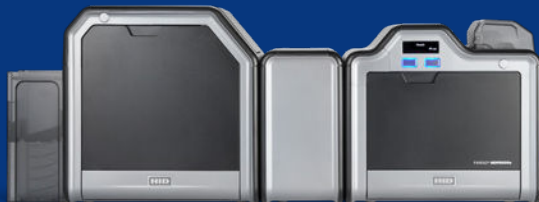
Dual-side printer with lamination